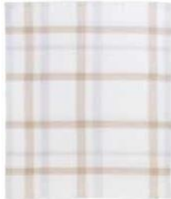
HAPPILY EVER AFTER