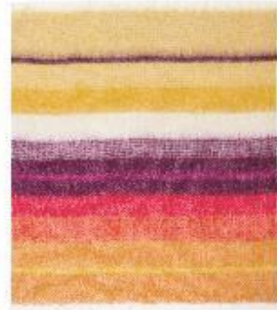
AFRICAN BRIGHT STRIPES