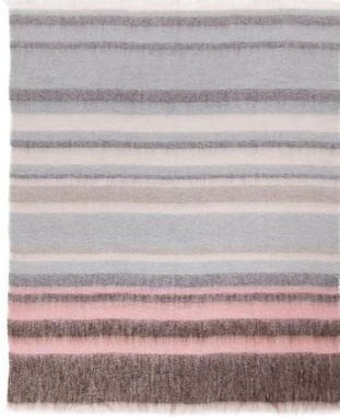
THE CHARTER HOUSE