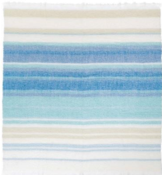
THE LIGHT HOUSE